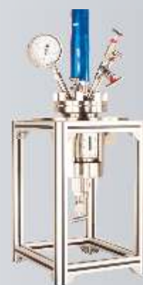
Sight glass along the vessel length