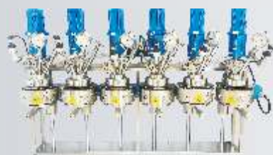
M6 model with fixed head design & inline BLDC motors