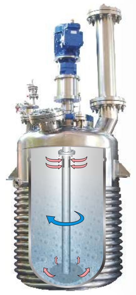
1000 ltr reactor