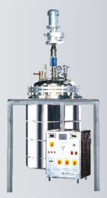
500 ltr reactor