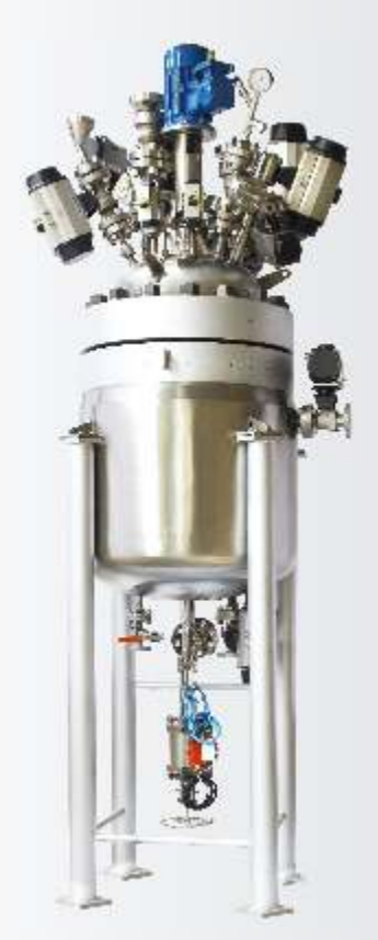
250 ltr 100 bar reactor with automated valves