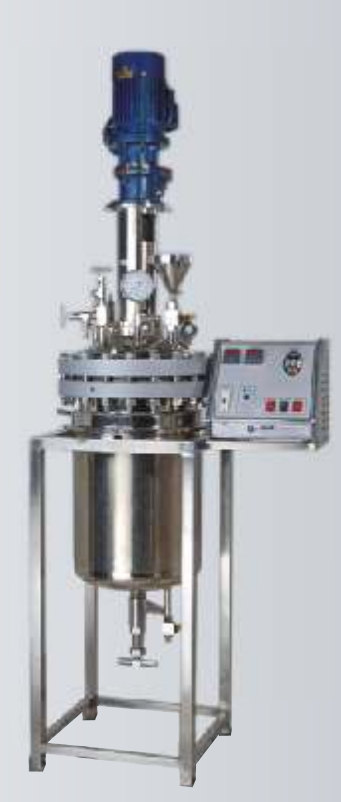
250 ltr reactor