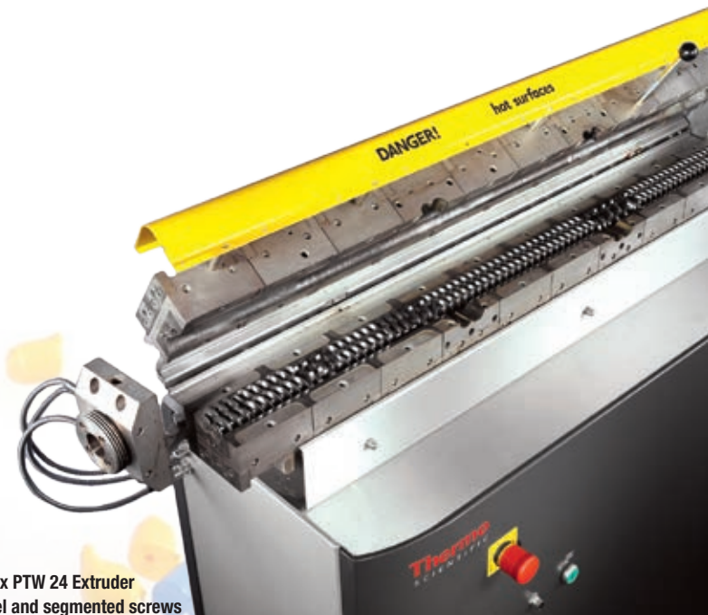
HAAKE Rheomex PTW 24 Extruder with open barrel and segmented screws