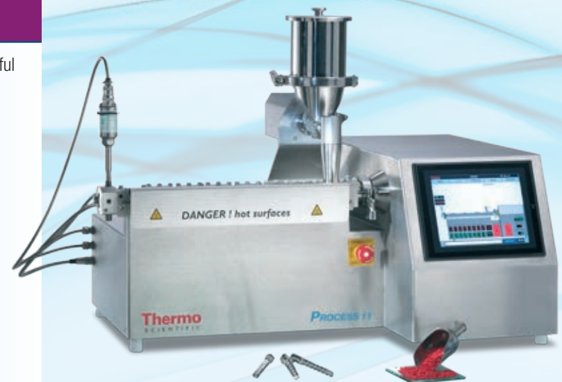
Process 11 Extruder