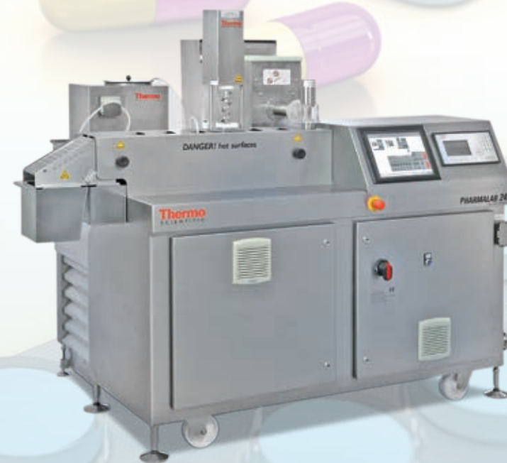
Pharma 24 Twin-Screw Extruder