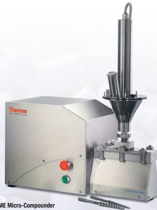
Pharma mini HME Micro-Compounder