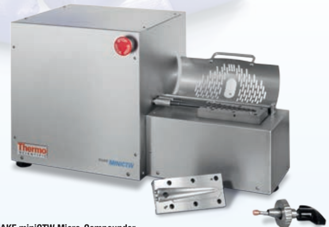
HAAKE miniCTW Micro-Compounder