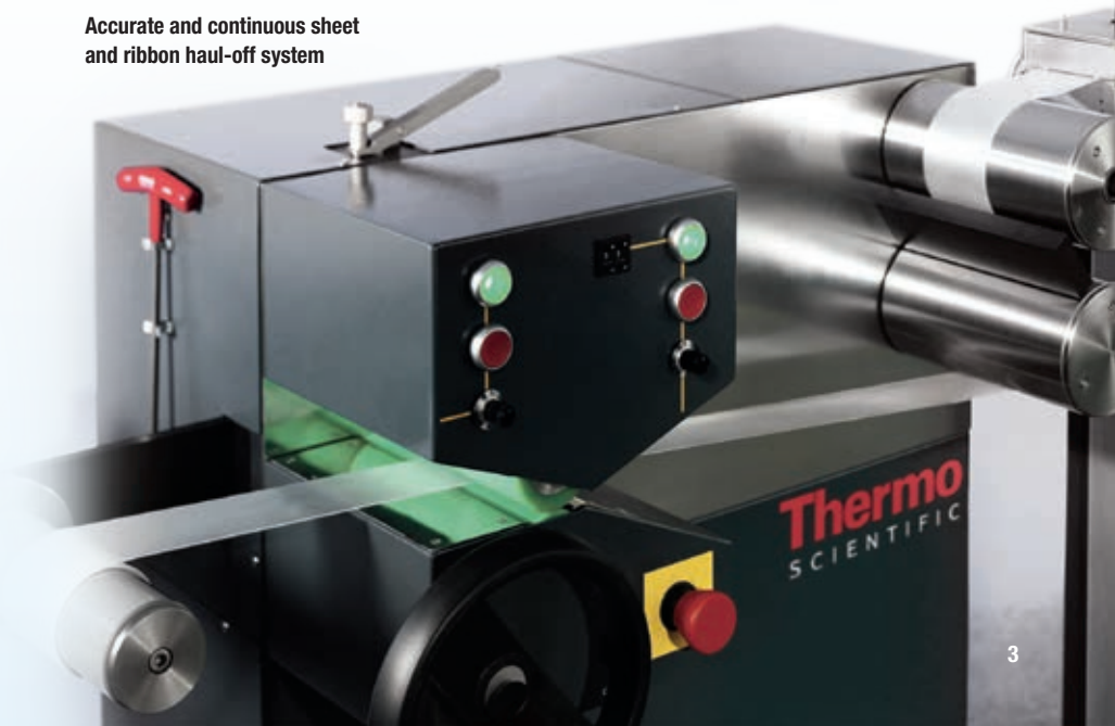
Accurate and continuous sheet and ribbon haul-off system