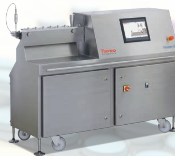
Pharma 16 Twin-Screw Extruder