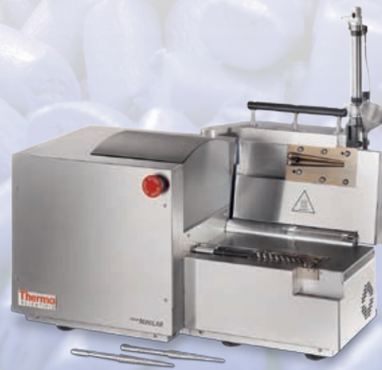
HAAKE MiniLab II Micro-Compounder