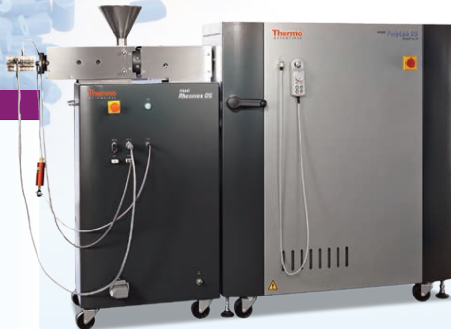
HAAKE Rheomex CTW 100 Extruder (left) connected to the PolyLab OS Drive Unit (right)