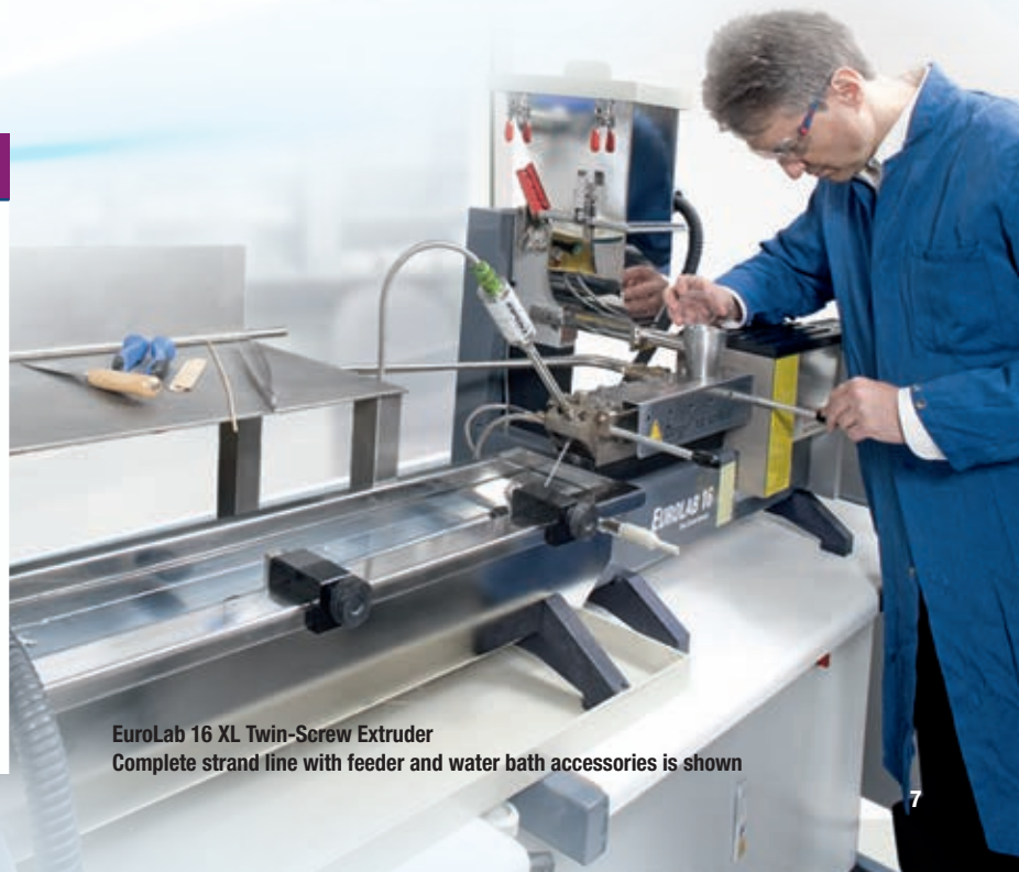
EuroLab 16 XL Twin-Screw Extruder Complete strand line with feeder and water bath accessories is shown