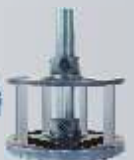
Rotating coupon holder assembly