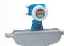
Coriolis Mass Flow Meter