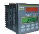
Flow Indicator & Totaliser