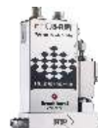
Coriolis Mass Flow Controller