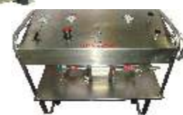
SS mounting with all fittings & valves